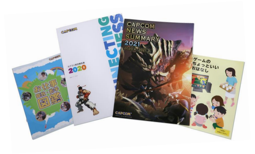
*The Encyclopedia of Work and Mathematics text (pictured far left) is only distributed in the Career Education Work × Mathematics program.