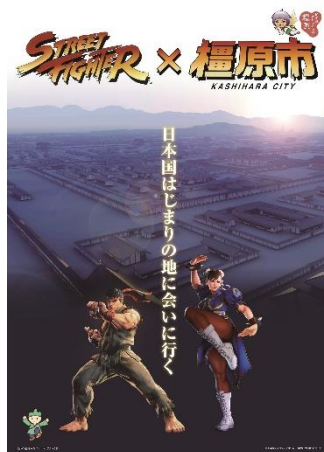
Collaborative Poster design

Driven by its philosophy of being a Creator of Entertainment Culture that Stimulates Your Senses, Capcom will work to address climate change and other issues facing society while aiming for sustainable growth through establishing a relationship of trust with its stakeholders and harmony with the environment.