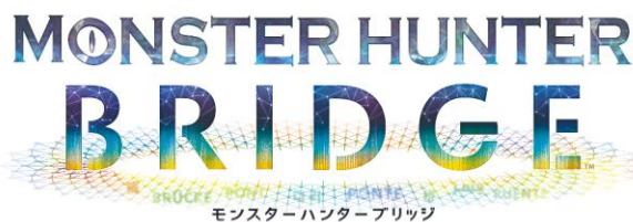
Monster Hunter Bridge logo

The theme of the upcoming Expo 2025 is “Designing Future Society for Our Lives.” Inspired by the “REBORN” theme of the Osaka Healthcare Pavilion, Capcom decided to exhibit an interactive attraction that incorporates the concept of nature, living things, and the wonder of life, which are important themes in the Monster Hunter series.