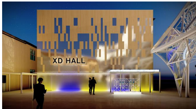
Exterior of the XD Hall