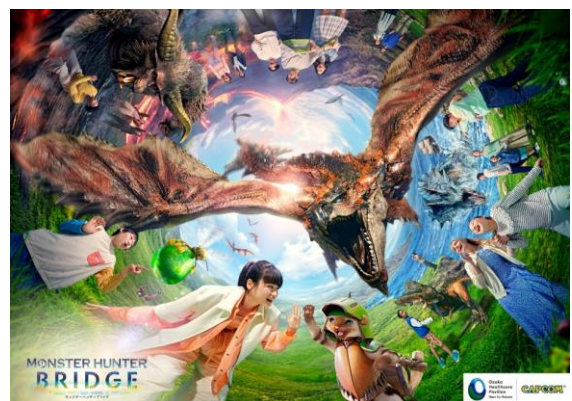
Monster Hunter Bridge key art