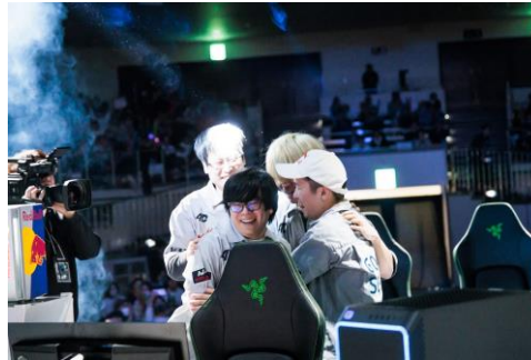
Street Fighter League World Championship 2024 Winning team: Good 8 Squad

*"PlayStation" is a registered trademark or trademark of Sony Interactive Entertainment Inc.