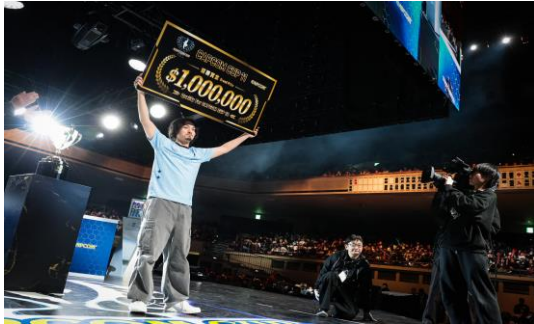
Capcom Cup 11 Winner: Kakeru